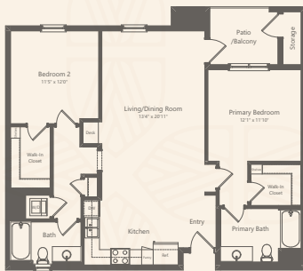
2C 2 BED | 2 BATH 1143-1181 SQFT.