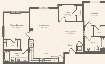
2D 2 BED | 2 BATH 1206-1238 SQFT.