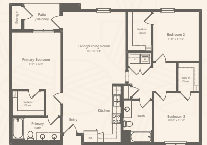
3A 3 BED | 2 BATH 1414-1415 SQFT

Floor plans are artist's rendering. All dimensions are approximate. Actual product and specifications may vary in dimension or detail. Not all features are available in every rental home. Prices and availability are subject to change. Rent is based on monthly frequency. Additional fees may apply, such as but not limited to package delivery, trash, water, amenities, etc. Deposits vary. Please see a representative for details.