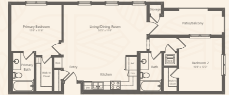
2A 2 BED | 2 BATH 1003-1005 SQFT.